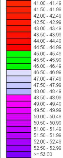
SOUNDING ELEVATION (MLLW)