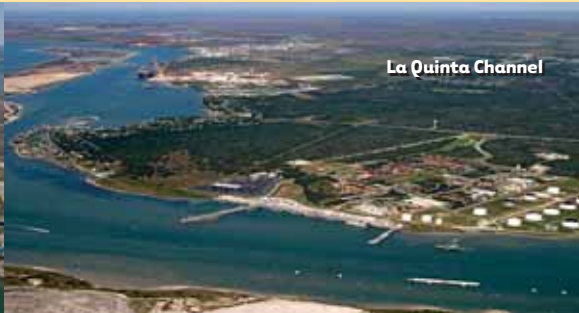
La Quinta Channel

An 1,100 acre greenfield site located on the north side of Corpus Christi Bay. When completed, the terminal will provide a multi-purpose dock and container facility.